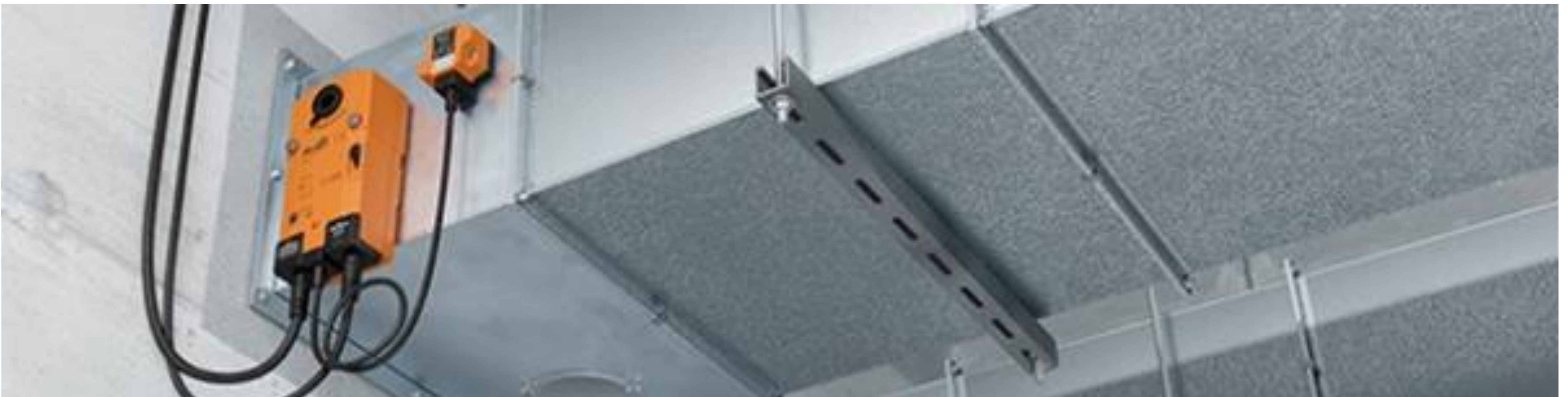
Fire Damper Actuator installed on ventilation Duct